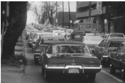
An example of CSD: The same street before....

Talk to your elected official, urge her or him to use the principles of context sensitive design locally and support the passage of Illinois Safe Routes to School legislation.