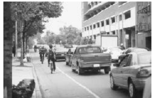
...and after a bike lane was added.