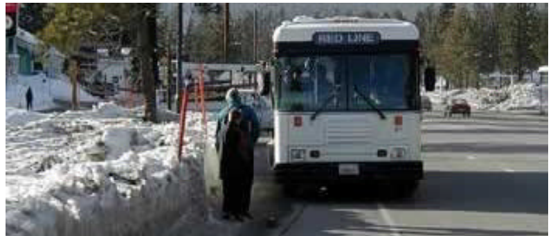
Transit access is impeded by poor snow removal policies

Numerous local road projects were cited as positive improvements. The most highly supported road improvements were intersection improvements such as left and right turn lanes or improved signal