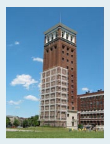
The First Sears Tower in Chicago's Lawndale community was the location of the Lawndale wireless antenna.