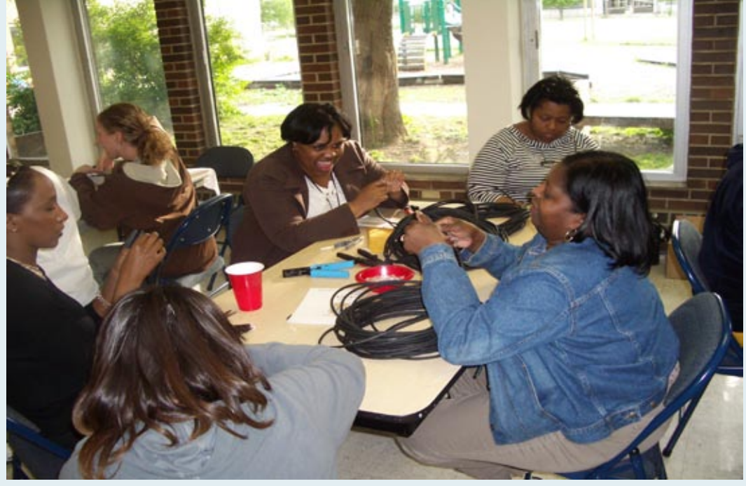
Node Building Party at Carole Robinson Center in Lawndale.