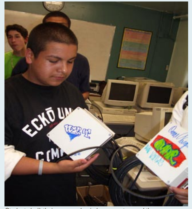
Students built their own mesh wireless repeaters and then personalized them.

1625 K Street, NW Suite 1000 Washington, DC 20006 Phone: (202) 232.4300 Fax: (202) 466.7656 http://www.mediaaccess.org